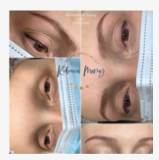
Microblading & Shading

£395 including review session (New Clients) £180 Refresh Top-Up up to 18 months later (Existing Clients only)